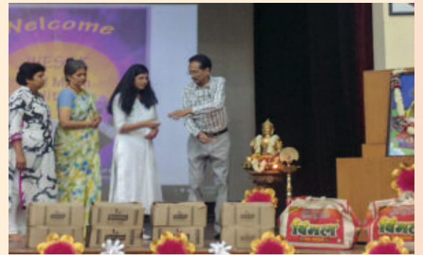
Wesak meditation was conducted at Foundation on 11 th May at 2 am and at Mahaveer Sabha Bhavan at 11am, attended by over 100 people.