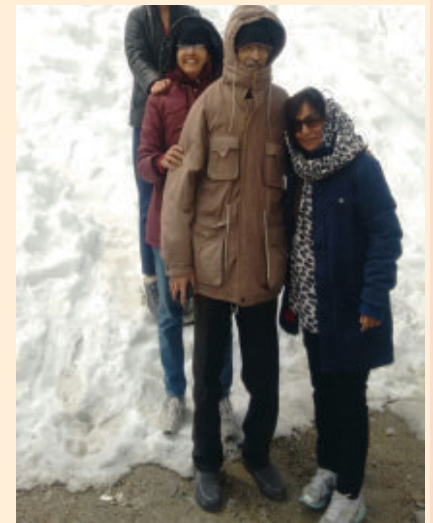
Leh: Khardung-La-Top 18300 ft. -highest motor able road of the world