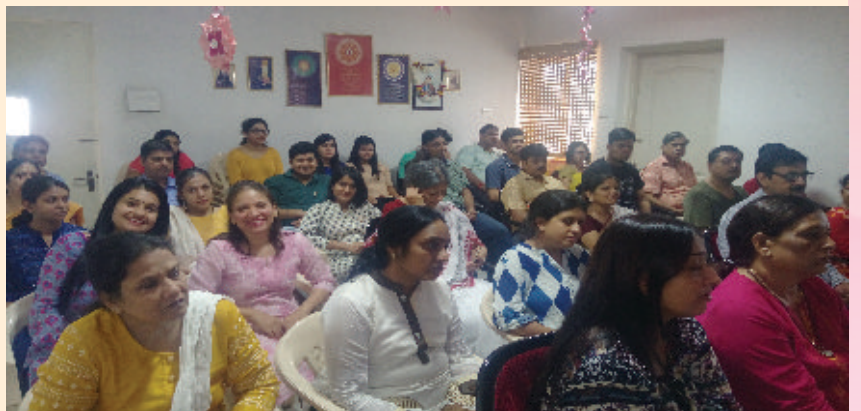
On 15 th Aug, the Foundation celebrated the Spiritual Independence Day