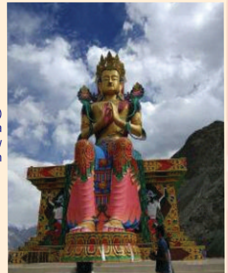
32m (106 foot) statue of Buddha Maitreya on top of a hill below the Diskit Monastery, Leh