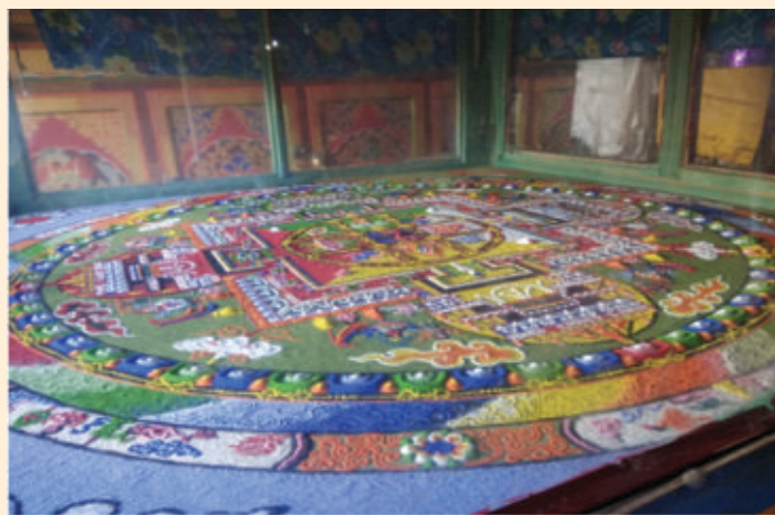
Mandala being drawn at Rizong Monastery