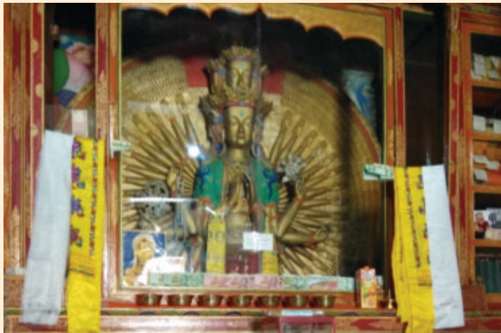
200 years old statue of Avalokiteshvara with 11 heads and 1000 arms at Likhir Monastery, Leh