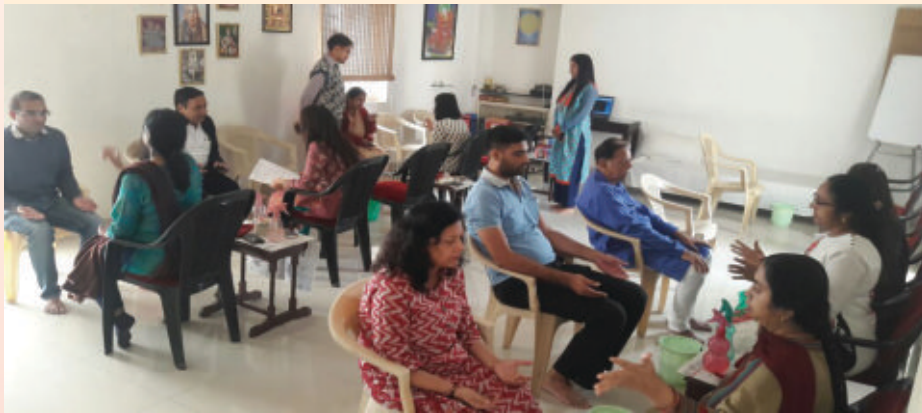
On 19 Nov. a free healing camp was successfully organised at Foundation which was attended by more than 70 people