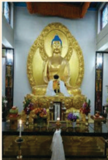
Buddha Sakyamuni at Shanti Stupa in Leh proper