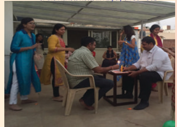
On 27 th Oct. we had a fun-filled Diwali get together with myriad games and mouth-watering food.