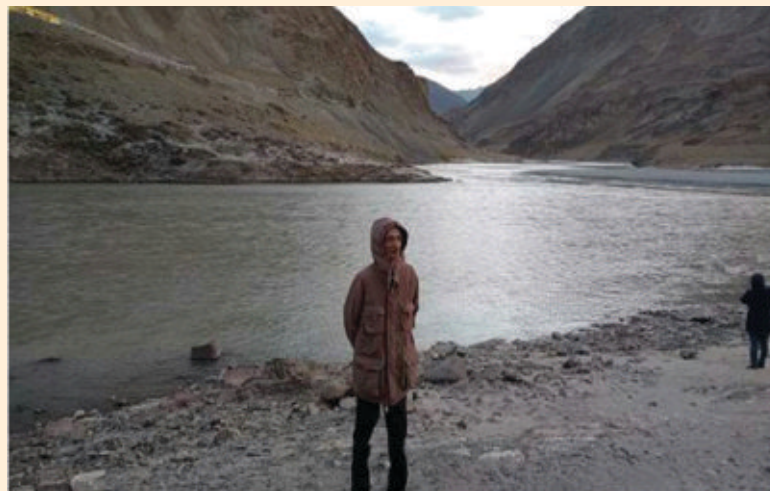
Sangam- confluence of Zaskar and Indus river