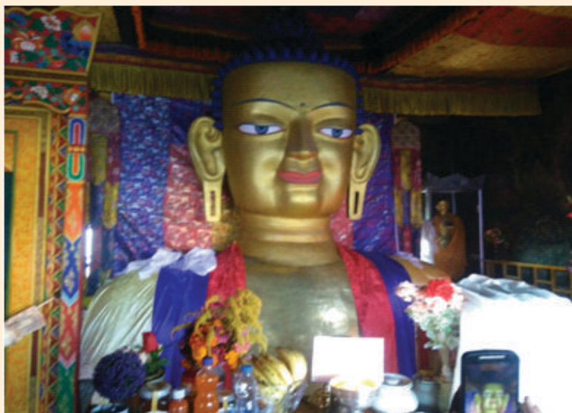
7.5 meters status of Buddha Sakyamuni rising to a height of 3 storeyed building.