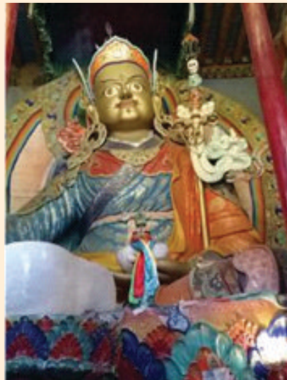
Buddha Padamsambhava at Hemis Monastery, Leh