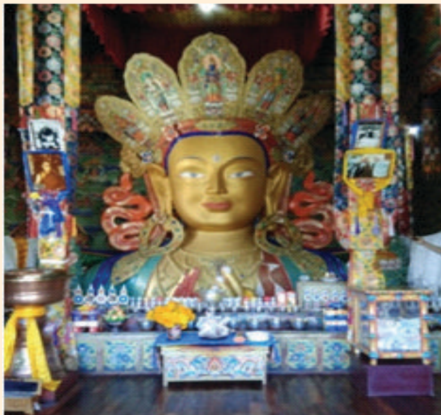
12 metres high statue of Maitreya, the largest statue in Ladakh, covering two stories of the building at Thiksey Monastery, Leh